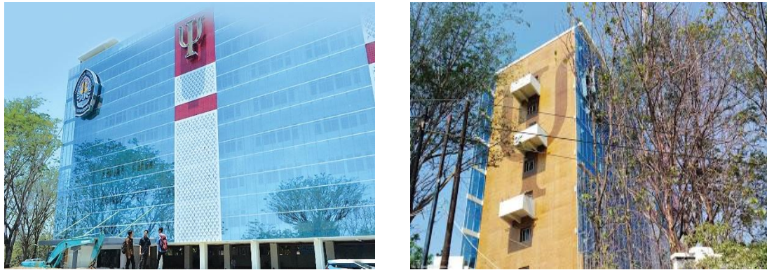
Figure 1. Faculty of Psychology at Diponegoro University Semarang.